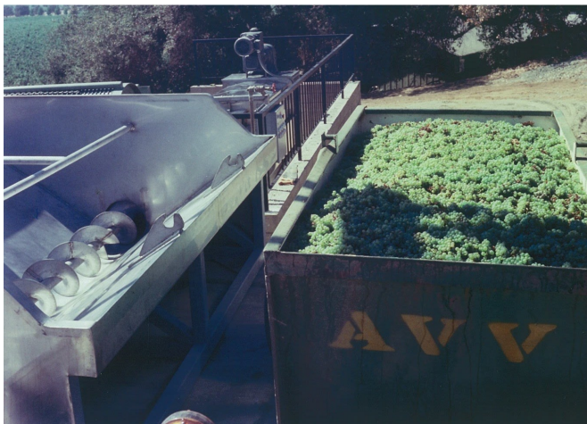
(First vintage at AVV in 1975)